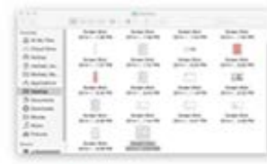
Finder - Desktop