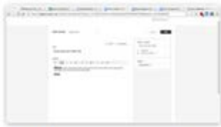
Google Chrome - Zoom Supp...